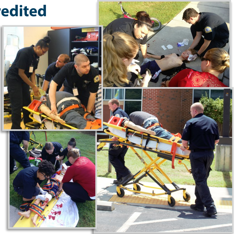
Paramedicine program students practice trauma scenarios for hands-on experience.

For more information, visit ChattahoocheeTech.edu