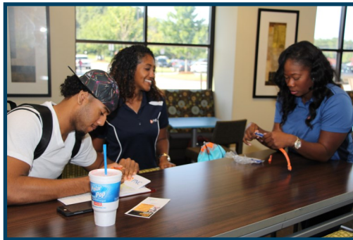
Chattahoochee Technical College's Campus Life welcomed back students for the fall term with an ice cream social and marketplace day.

The Marietta Campus remains the top physical campus for student enrollment with 4,095 students. The North Metro Campus is next in line with 2,921 students and is followed by the Paulding Campus with 910 students, the Canton Campus with 848 students, and the Mountain View Campus with 727 students. Additionally, 533 students are registered for classes at the Woodstock Campus and another 418 have signed up for classes at the Appalachian Campus. About 4,100 are taking