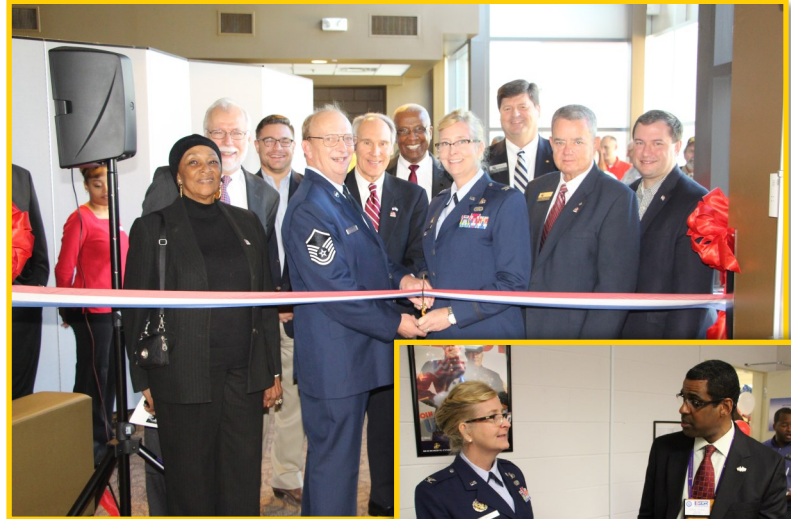
The Veteran Service Center is now open at the Marietta Campus.