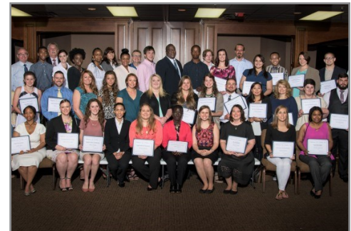
The Chattahoochee Tech Foundation will hold its annual Scholarship Awards Luncheon on Friday, April 21. The Foundation has received more than 200 applications.