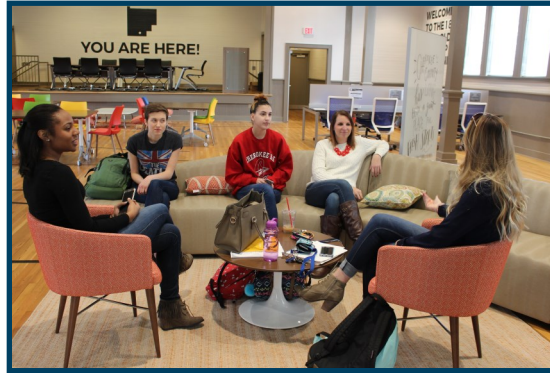
Chattahoochee Tech students mingle at The Circuit located on the Woodstock Campus.

Located on Chattahoochee Technical College's Woodstock Campus at One Innovation Way, The Circuit was created to foster entrepreneurship and business development within Cherokee County and is now available for use by business owners, startups and students. Similar to a business development center, tenants are offered training resources for preparing business plans, marketing strategies and increasing cash flow. The Circuit also has centralized office resources available, and is open to