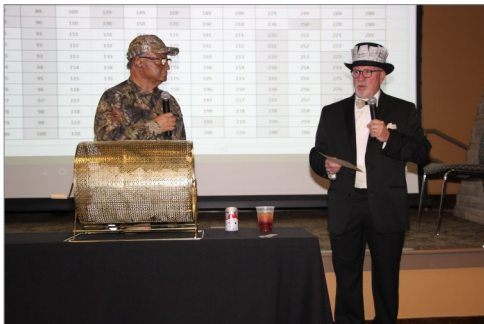
The Chattahoochee Tech Foundation raised $24,097 during a Reverse Raffle held in the fall. The funds will be used to provide scholarships and emergency grants to students.

The Chattahoochee Tech Foundation’s mission is to provide philanthropic support to the college, its students, and programs. Designed to support the mission of Chattahoochee Technical College, the Foundation partners with businesses, alumni, and friends, to make higher education an affordable reality for students in our community. To learn more about the Foundation, visit ChattahoocheeTech.edu and select “Foundation/Alumni” in the menu bar.