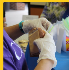
Service Learning 2