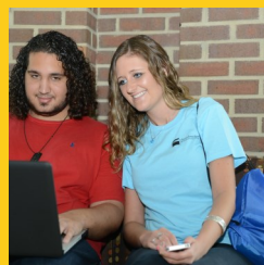
Academic News 3