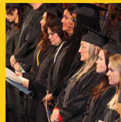
Upcoming Events 4