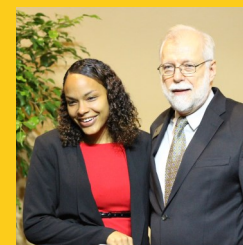
Success at CTC