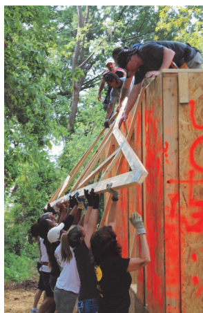
Chattahoochee Tech students help build a house for Bartow County Habitat for Humanity