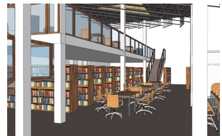
This artist rendering of the new library shows the interior of the new facility.

Construction consists of an addition to the existing 2,400 square feet of library space, plus a mezzanine study area. The final design also includes a circulation desk, librarian office, workroom, computer carrels and two study rooms for small groups. The renovations are expected to allow for a doubling of the number of computers and study space available originally. The $834,271 contract for the project went to Prime Construction.