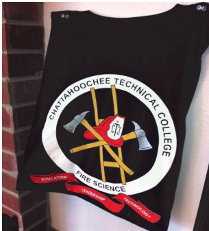
This shirt from CTC Fire Science is hanging on the wall at Fire House Subs in Marietta.

Chattahoochee Technical College was recently named one of the Top 100 Colleges where Graduates Save Lives. This list, which is put together by FireScience.org, looked at more than 2,500 accredited schools and programs throughout the United States to determine those that offered the best first response programs. Like many of the colleges on the list, Chattahoochee Technical College offers Fire Science, Emergency Medical Services and Paramedicine to students at the diploma or associate degree levels. Each of the programs offers innovative classroom, online, hybrid or clinical experiences that prepare the students for the job market.