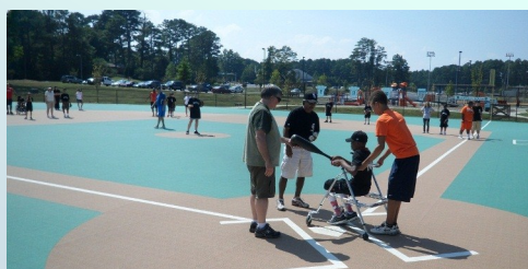
Helping a young man improve his batting ability at the 2012 Covering the Bases event, sponsored by the Acworth Police Dept.

Service Learning is a great way for you to learn more in your classes while helping others in the community!