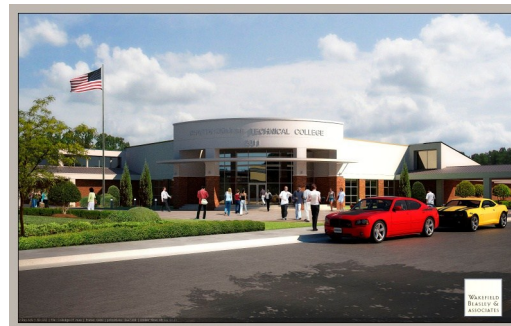
Architectural rendering of new building façade.

A brand new Student Center is currently under construction at the North Metro campus as part of a major renovation project in Building A.