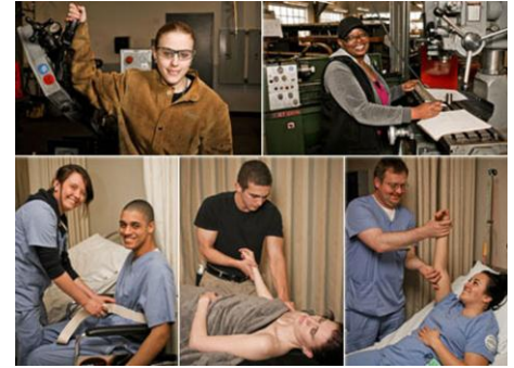
Today, many women and men are breaking down barriers to pursue careers.

The Office of Special Populations can offer advice and resources available to help you make a decision.